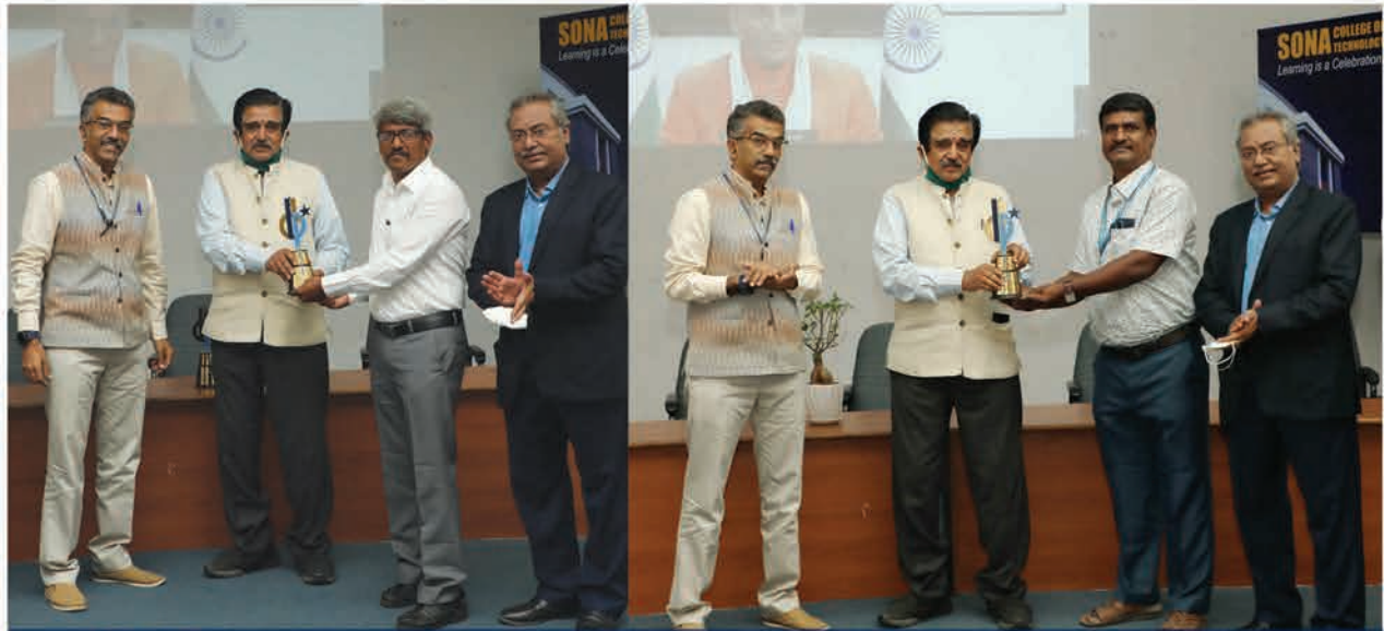
AICTE - CII award given to Mechanical Engineering. Fashion Technology department awarded AICTE - CII Mentor status