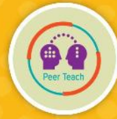
Facilitating Student - to - Student Teaching