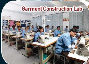
Garment Construction Lab