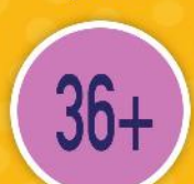
World class R&D Centres