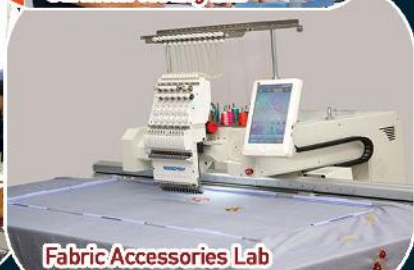
Fabric Accessories Lab