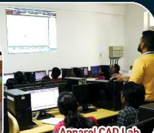
Apparel CAD Lab