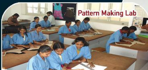
Pattern Making Lab