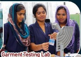
Garment Testing Lab