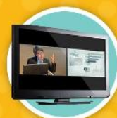
Lecture Capture System

Good base for higher studies (MTech/MBA/NIFT).