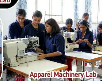
Apparel Machinery Lab