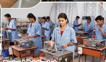
Dyeing & Printing Lab